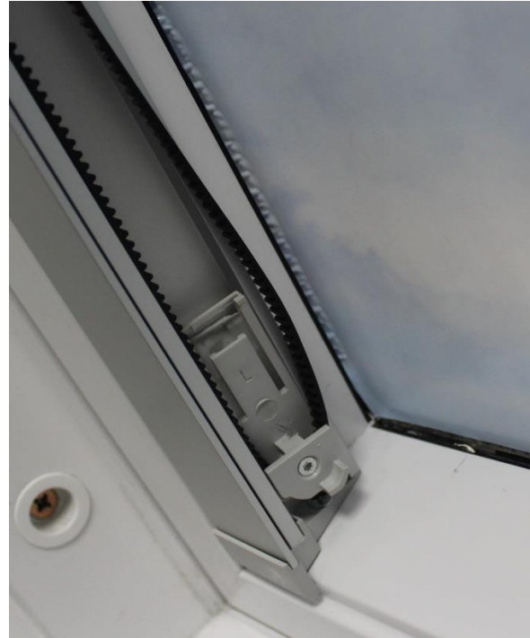
The Incorrect Way

Make sure the tension clip slides down flush to the back of the siderail.