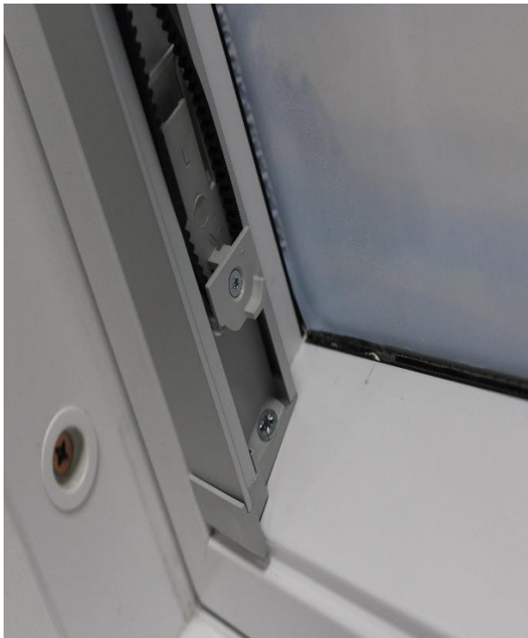
The Correct Way