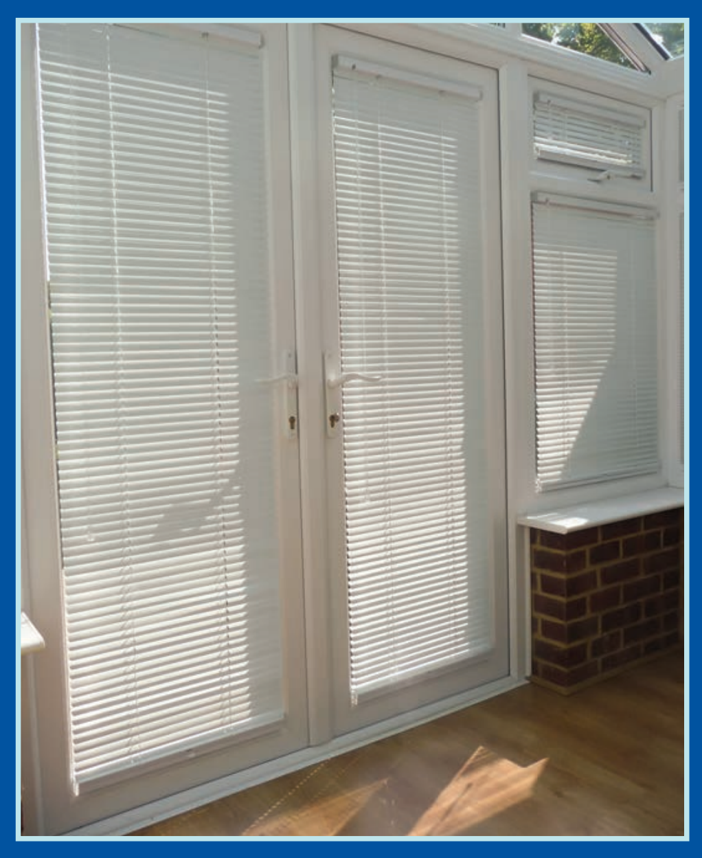
*English Heritage Report 2009