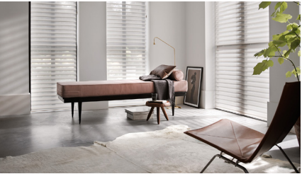
Silhouette® Shades Gentle translucency for an endless variety of moods.