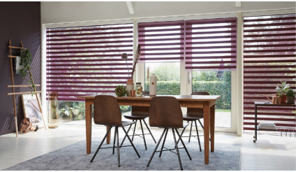
Facette® Shades Soft, stylish fabrics with unique light control.