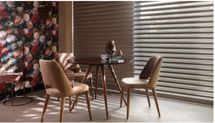
Pirouette® Shades Softly filtered light with enhanced views and privacy.