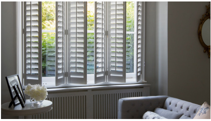
Interior Shutters Stylish and timeless look.