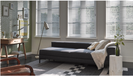
Venetian Shades Create light control and privacy with this design classic.