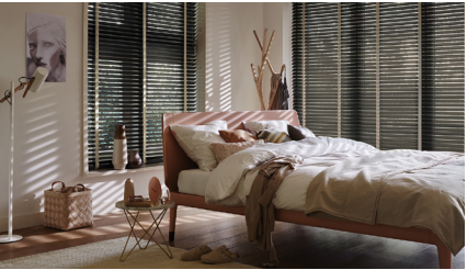
Wood Shades Enjoy nature's warmth and beauty in your home.