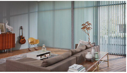
Vertical Shades Elegant simplicity for larger windows.