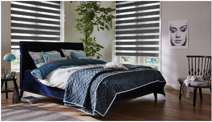
Twist® Shades Distinctive style with privacy and light control.