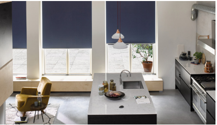
Roller Shades Express your style with an individual touch.