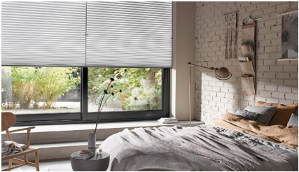
Duette® Shades Filtering light and insulating your home all year round.