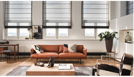
Roman Shades Decorative fabrics, tailor-made.