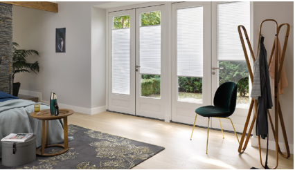
Plissé Shades Uniquely decorative, with a shape that suits your style.